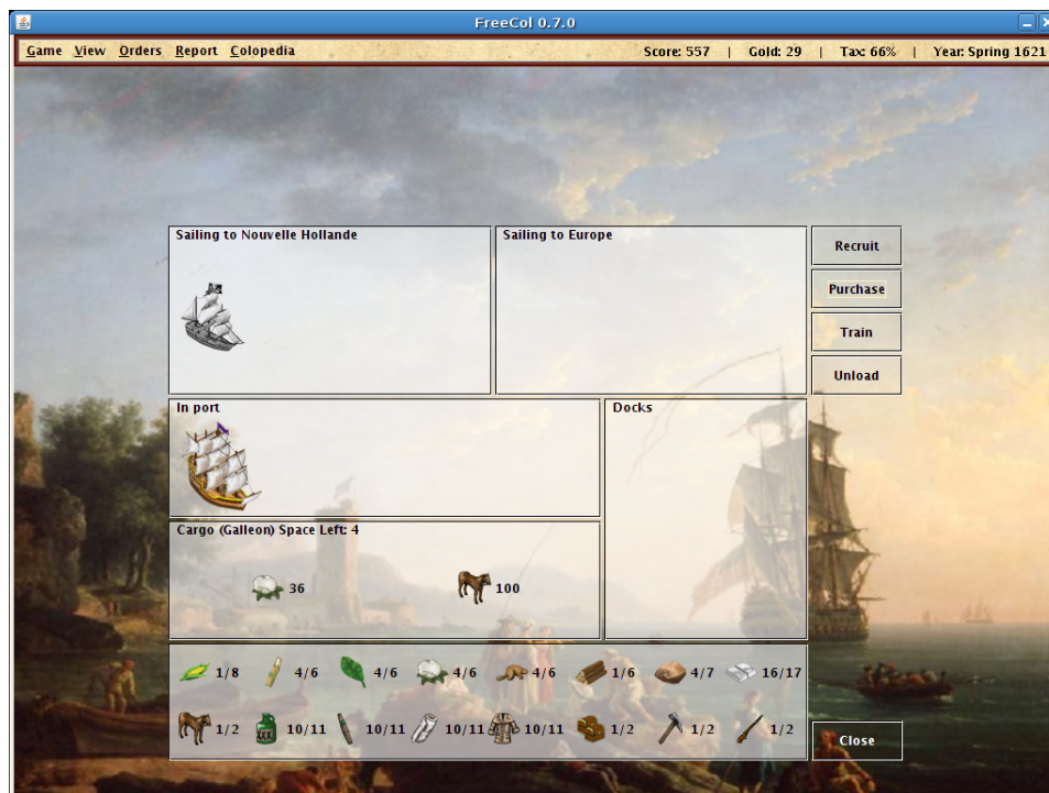
Figure 2: The Europe Panel