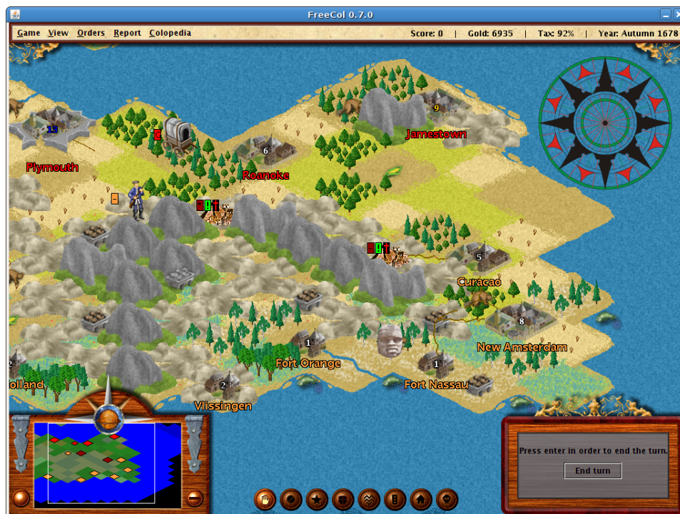
Figure 1: The main screen.

The figure 1 represents the main screen.